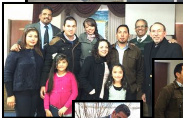
Pastors & Missionaries with their families in the Missions Conference at El Calvario